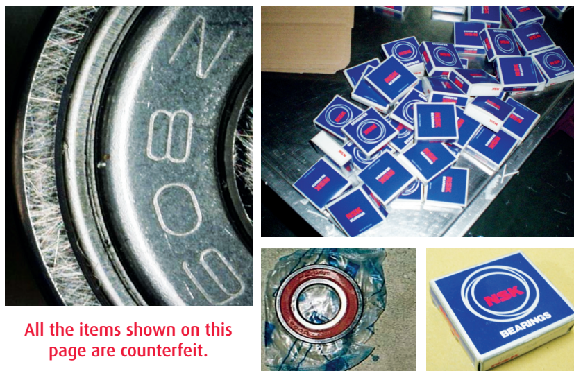
All the items shown on this page are counterfeit.

Counterfeit bearings are a global issue, with all markets being highly susceptible to the risks of buying these low-quality products.