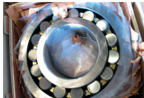
Both images are counterfeit. Incorrect wrapping and no markings.