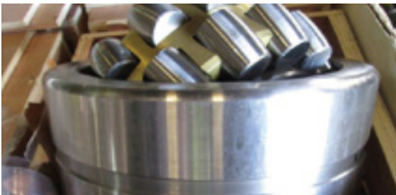
Is it counterfeit? Yes. Things to look for: no lifting holes, corner radius should not be polished, no indent in rollers.

Although they look similar in general appearance, you can see several areas in which they are different including indentation on the rollers.