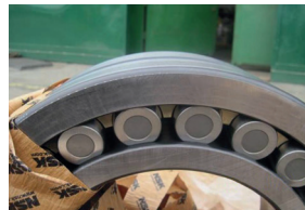
A. Authentic NSK product