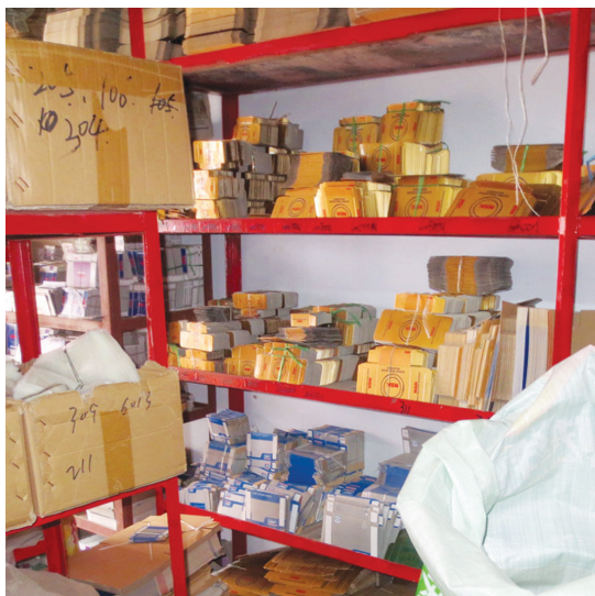
Counterfeit NSK packaging recently seized by police.

Established for over 100 years, NSK is recognised around the globe for manufacturing high-quality, reliable bearing products that are used in many different industries, including automotive.